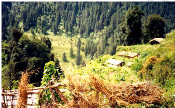
Figure 16.2 A view of a forest life

Industries would consider the forest as merely a source of raw material for its factories. And huge interest-groups lobby the government for access to these raw materials at artificially low rates. Since these industries have a greater reach than the local people, they are not interested in the sustainability of the forest in one particular area. For example, after cutting down all the teak trees in one area, they will get