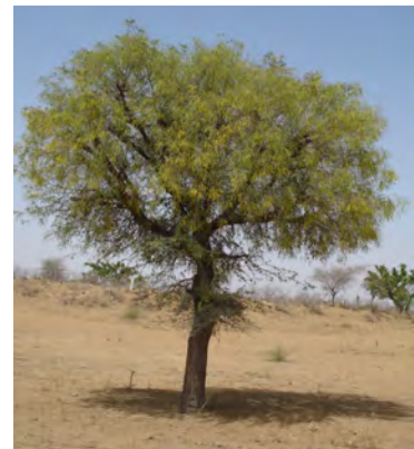
Figure 16.3 Khejri Tree

We need to accept that human intervention has been very much a part of the forest landscape. What has to be managed in the nature and what may be the extent of this intervention? Forest resources ought to be used in a manner that is both environmentally and developmentally sound – in other words, while the environment is preserved, the benefits of the controlled exploitation go to the local people, a process in which decentralised economic growth and ecological conservation go hand in hand. The kind of economic and social development we want will ultimately determine whether the environment will be conserved or further destroyed. The environment must not be regarded as a pristine collection of plants and animals. It is a vast and complex entity that offers a range of natural resources for our use. We need to use these resources with due caution for our economic and social growth, and to meet our material aspirations.